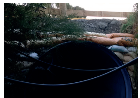
Minimal cover required when correctly installed.