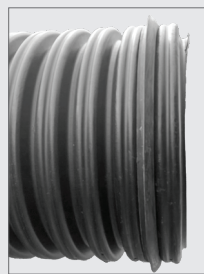
160mm-1000mm pipe - the rubber ring sits between the first and second corrugation.