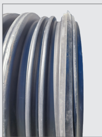
1200mm pipe - the rubber ring sits in the first corrugation.